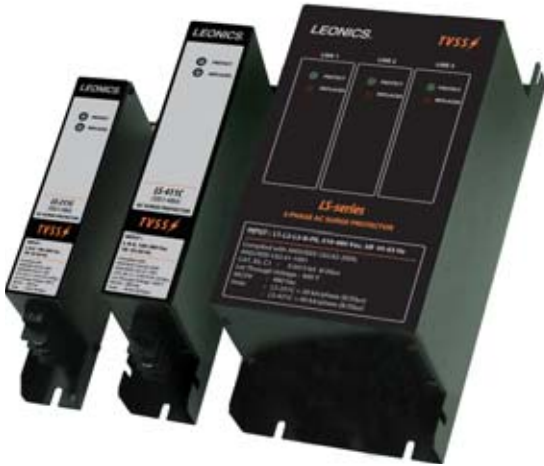
LS Surge Diverter