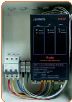
sample of inside enclosure