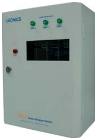
LS Surge Diverter with Enclosure

LS-series Surge Diverters provide high energy surge diversion for protection against power surge caused by external sources as lightning strikes and substation switching. LS-series Surge Diverter is designed for mounting at point-of-entry / service entrance, main switchboard or distribution board, sub-distribution board for preventing damage to switchboards and your equipments. Protection and replacement status are indicated by LED indicators. And remote alarm contact provide dry contact signal to allow remote status monitoring.